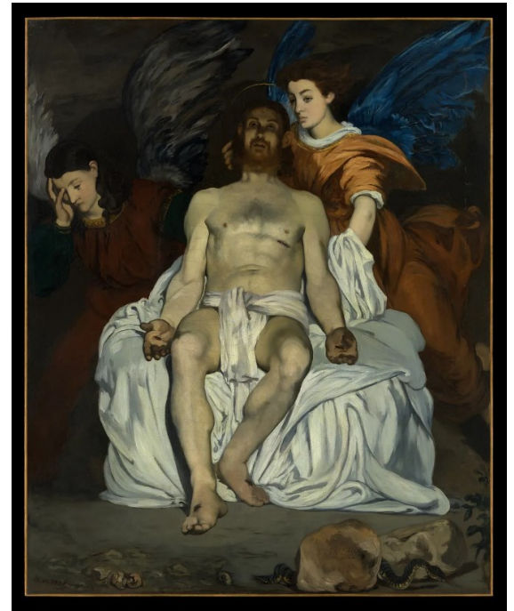
The Dead Christ with Angels (Édouard Manet, 1864, oil on canvas)

We are a Christian community of faith that shares the love of God with all people everywhere."